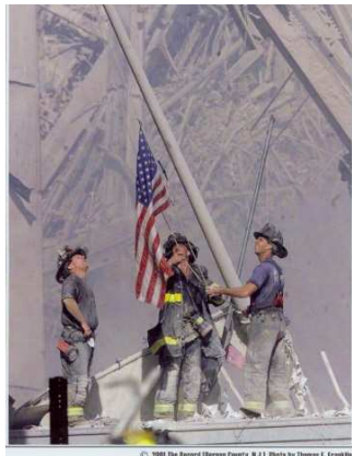
Original photograph of Firefighters on 911

Copyright permission to create this monument in the likeness of the photo "Three Firefighters Raising the American Flag on 9/11" U.S. Copyright Registration No. VA-1-014-297 granted by North Jersey Media Group Inc. and The Bravest Fund.