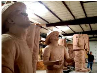
3 times life-size colossal monument in clay

After the tragic events of 9/11/01 brought on by terrorist attacks, the people of the United States of America were in shock. As rescuers from across the nation worked to save those who were still alive amidst the wreckage of the World Trade Center, a flag was raised by three firemen. They did it as a symbol of hope to help themselves and their fellow rescuers go on amidst the destruction. They did not realize they were being photographed at the time. But Thomas E. Franklin, a photographer for the New Jersey Record saw and captured an image of that flag being raised which went on to remind the people of the entire country that we are united.