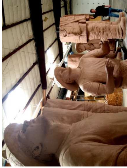
3 times life-size colossal monument in clay

The Monument will be a 3 times life-size (colossal size) bronze sculpture depicting three American firefighters raising the flag of the United States of America amid the destruction of 9/11/01. It will be located at the National Fallen Fire Fighters Memorial in Emmitsberg, Maryland.