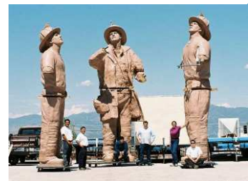
3 times life-size colossal monument in clay