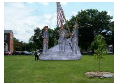
Overlay photo of memorial plaza

Phone: 801-649-5823 Fax: 801-649-3673 Toll Free: 877-404-4266 ToLiftANation@ICONBronze.com ToLiftANation.com